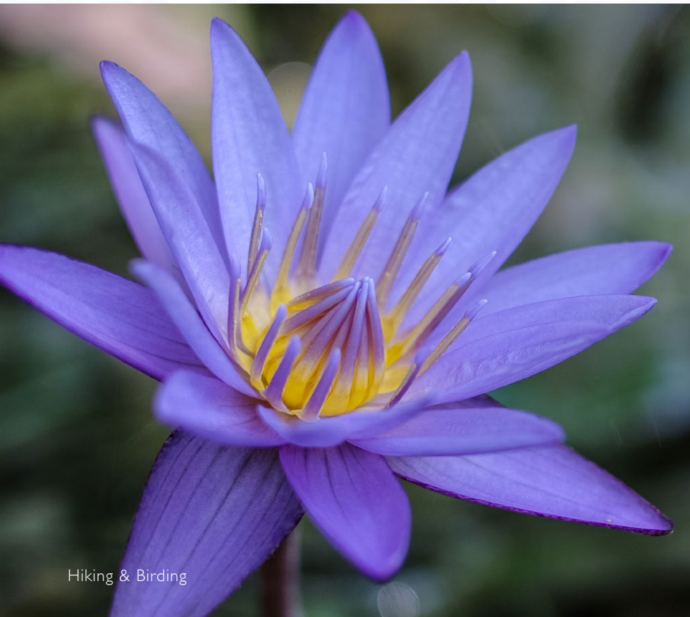
Hiking & Birding